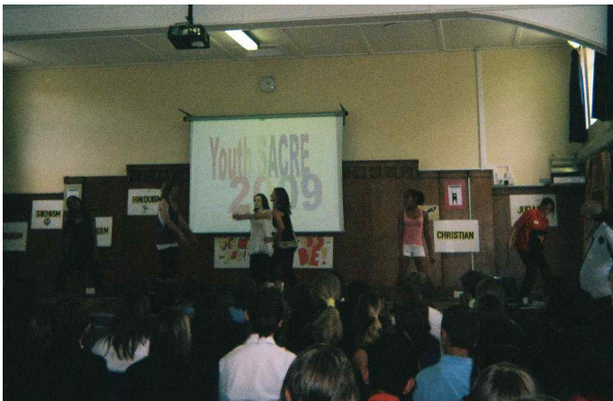
Pupils present their work at Youth SACRE 2009

Following on from the success in previous years, SACRE will again be holding a Youth SACRE event in 2012. This will be aimed at Year 8 pupils all across Warwickshire and will be held on Friday 22nd June 2012 . Please make a note of this date in your diaries. Further details will be sent to schools during the Autumn Term.