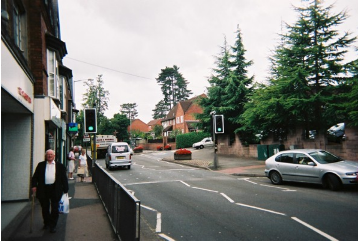
Figure 2: Alcester Road, Studley at the pedestrian crossing