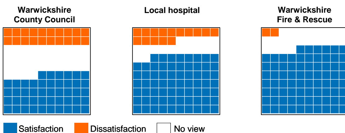
Figure 2: Satisfaction with public services in Warwickshire per 100 residents, 2009/10

The Partnership Place Survey also asked questions about satisfaction with services provided or supported by local authorities. Satisfaction with environmental services such as refuse collection, doorstep recycling and recycling centres are rated highly by respondents, lower levels of satisfaction have been recorded with some transport and recreational services.