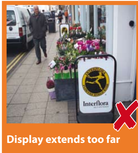
Display extends too far

The County Council wishes to work with businesses and the community to achieve a sensible and practical solution for the use of advertising signs. Plans will be made available to show any local town specific constraints to the use of advertising signs or displays.