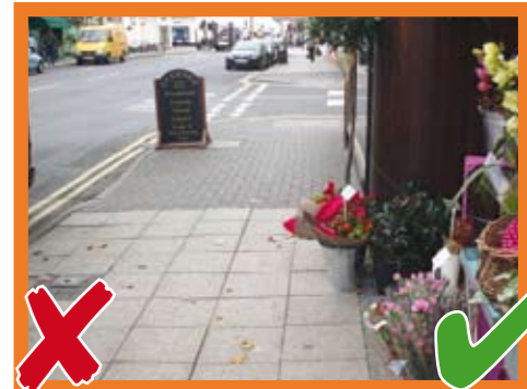
'A' board near crossing point