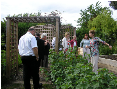
Photo showing tour of St Benedicts Catholic Primary's vegetable area

The first two Sustainable School / Eco School Best Practice meetings were held in June and covered North Warwickshire and Rugby areas. The meeting proved quite a success especially for schools just beginning their eco school journeys. Thank you to St Benedicts Catholic Primary, North Warwickshire and Henry Hinde Infants, Rugby for hosting these meeting and sharing a wealth of knowledge and ideas.