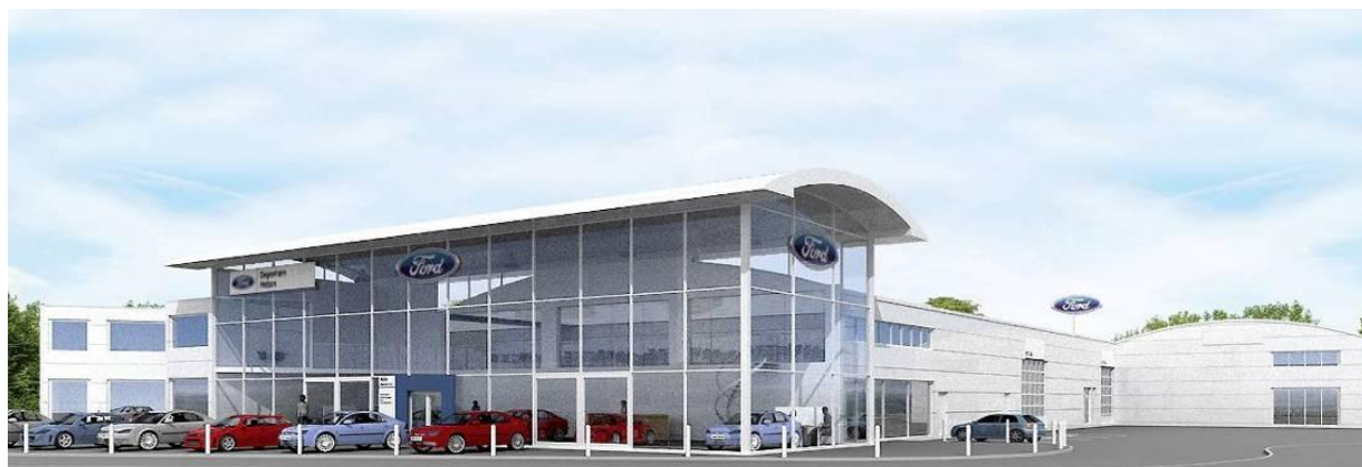
Artist impression of the new Dagenham Motors dealership in Barking, East London

Perpetual Energy (PE) was appointed early in the conceptual design stage and this ensured a full package of renewable energy solutions were fully utilised and integrated into the overall design. The new state of the art site will be Ford's greenest dealership in the UK and will act as a model for future developments.