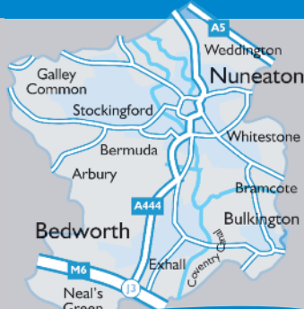
Nuneaton and Bedworth Borough