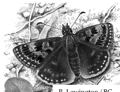
R. Lewington / BC

The dingy skipper butterfly is well-named. It appears from a distance to be drab and unspectacular and is easily mistaken for a day flying moth such as the burnet companion, or more likely, overlooked completely. In dull weather and at night it perches on the top of dead flower heads in a moth-like fashion with wings curved in a position not seen in any other British butterfly. On warm sunny days it can be highly active and territorial.