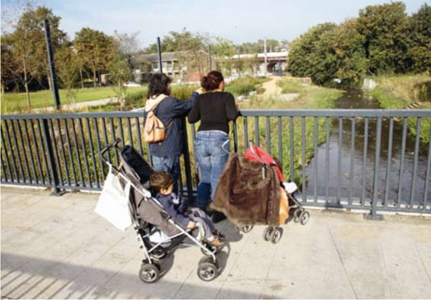
Young parents overlook the wildlife on Lewisham's River Quaggy

system, created 60 hectares of new open space in land surrounding schools, leased 4 hectares to create greenways along inland waterways and provided permanent protection for 40 community gardens.