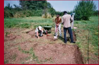
Clearing the site